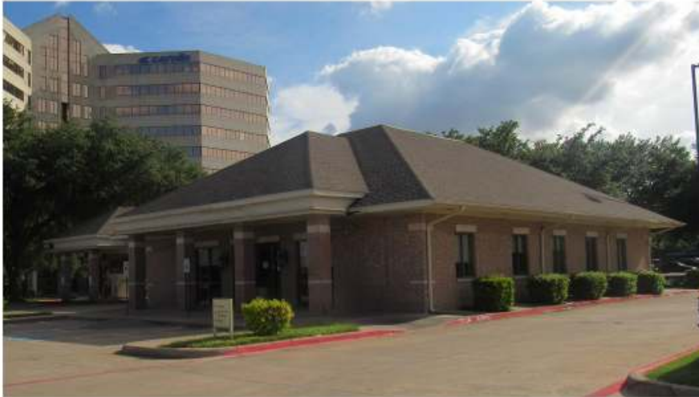
FORMER BANK BUILDING W/ DRIVE-THRU • FORMER VERITEX COMMUNITY BANK •