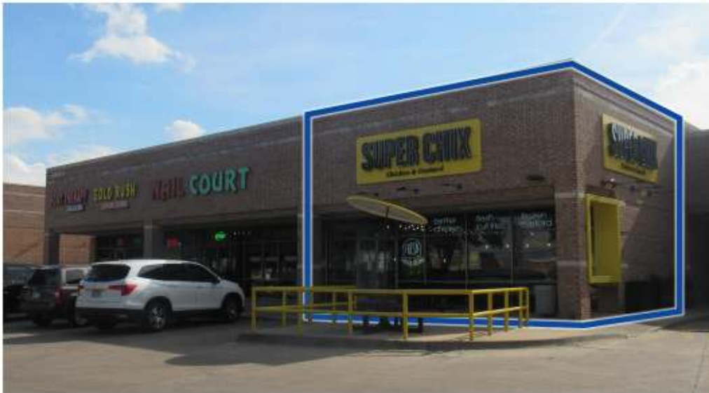
ENDCAP SPACE (±2,800 sf) • TENANT CURRENTLY OPERATING - PLEASE DO NOT DISTURB EMPLOYEES •